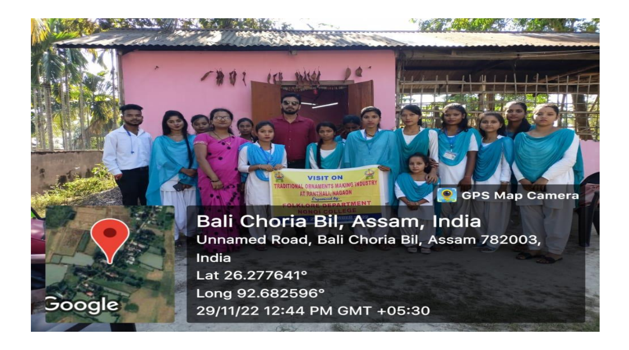
Field Visit To Ranthali