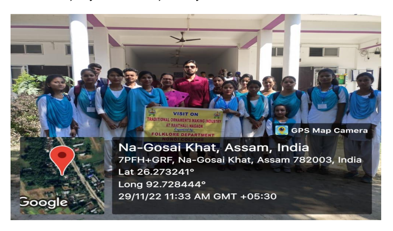
Field Visit To Ranthali

The Department of Folklore organized another field visit to Ranthali on 11<sup>th</sup> November, 2022. As already noted in the earlier report Assam is known for its plains with greenery, varied wildlife, exquisite jewellery styles, bountiful nature resources and diverse culture. The traditions and attire of Assam along with its enchanting jewellery styles reflect the rich cultural legacy of many tribes and kingdoms that have shaped the state's culture. Traditional Assamese jewellery is crafted by a group of Artisans known as "Sonari". Most of the jewellery styles contain silver or lac as their base metal and gold foil as their coating. Ranthali Village is famous for "Assamese jewellery" not only in the state but also throughout India. Located approximately 8 k.m. away from Nagaon town, Ranthali village is the home to the majority of the skilled jewellery artisans of Assam.