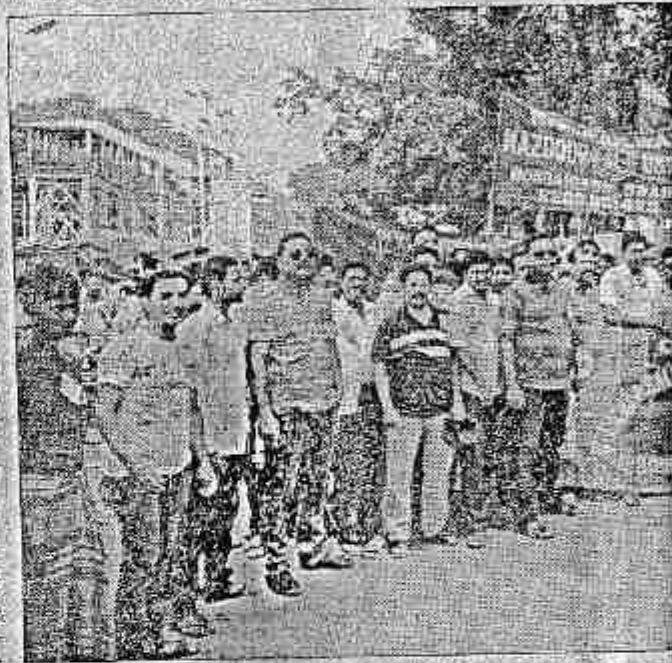
Members of various trade unions taking out a rally on the occasion of May Day.

To mark the occasion, a procession was taken out through the main thoroughfares of the village. Later, a seminar on the relevance of the day, the