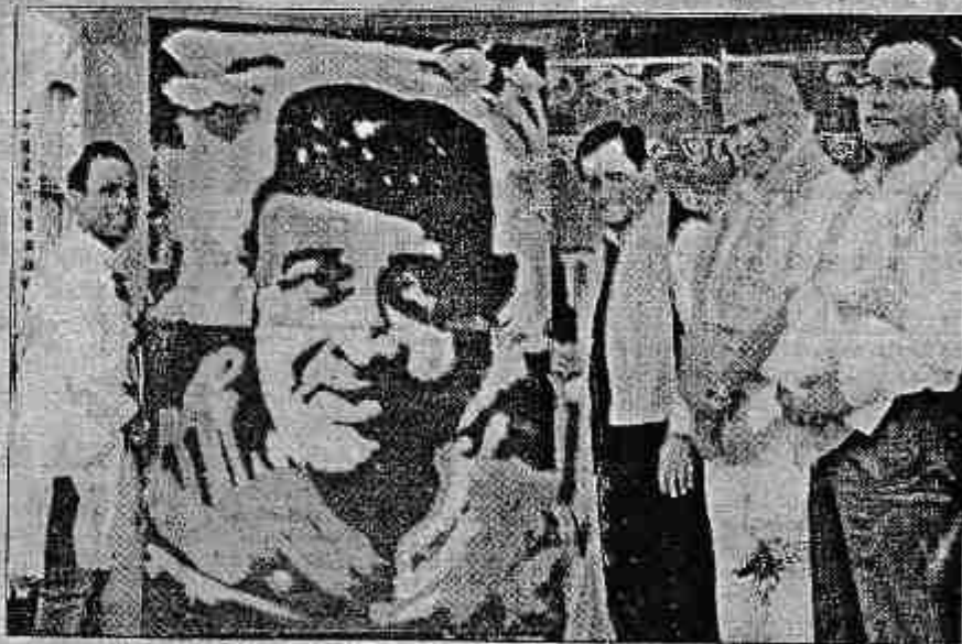
Assam Governor Banwarilal Purohit, CM Sarbananda Sonowal and Cultural Affairs Minister Naba Kumar Doley posing for a photograph in front of a portrait of Dr Bhupen Hazarika during a programme organized by Sanskar Bharati on the 5th death anniversary of the bard in Guwahati on Saturday.