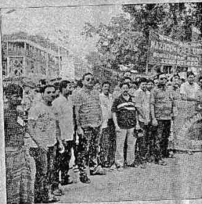
Members of various trade unions taking out a rally on the occasion.

To mark the occasion, a procession was taken out through the main thoroughfares of the village. Later, a seminar on the relevance of the day, the