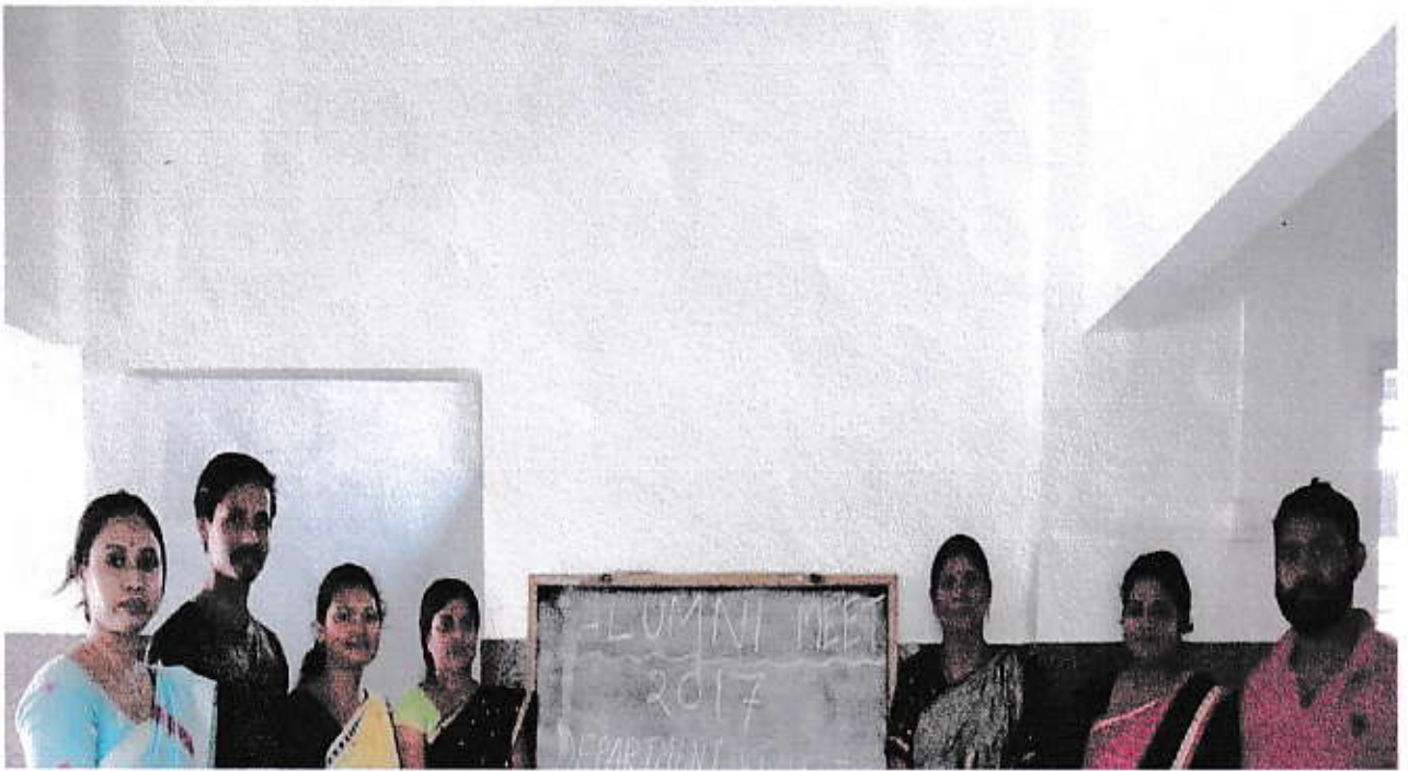
Alumni Meet Batch-2017 Date:- 19-12-2017