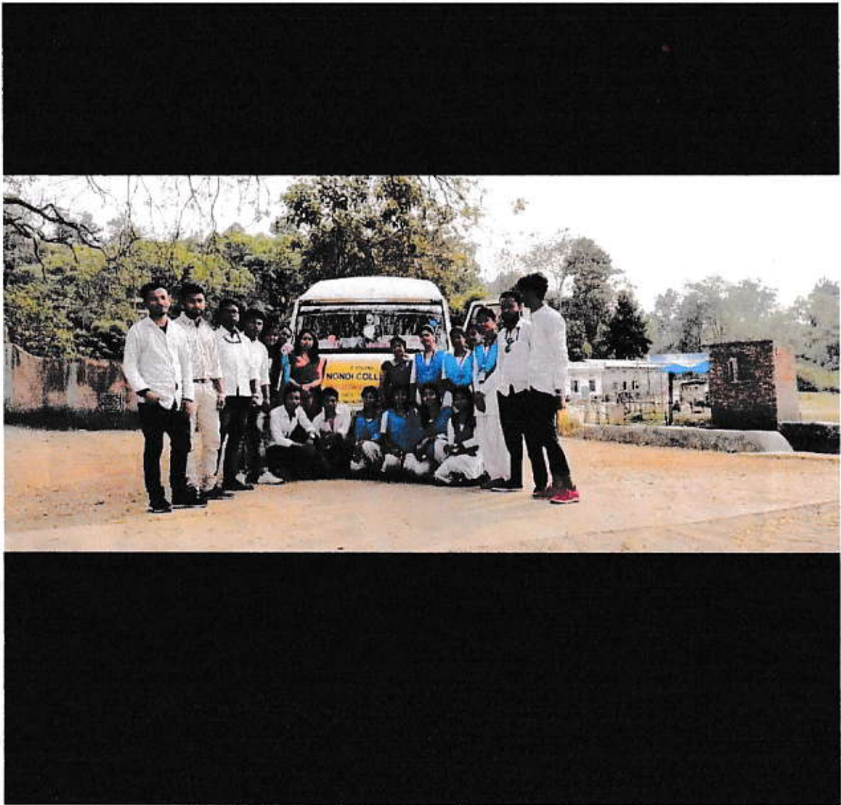
Educational Tour to Nijokapaz - 2020

Ban Principal, i/c Nonoi College Nagaon (Assam)