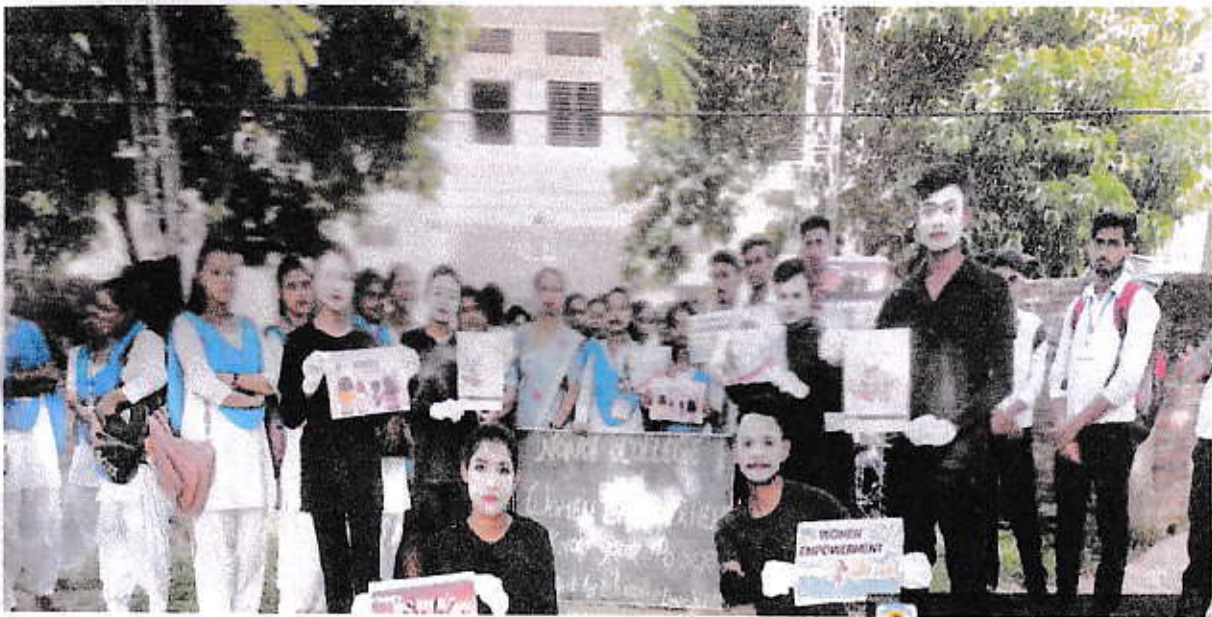
Awareness programme through Mime Acts for Empower of Women.