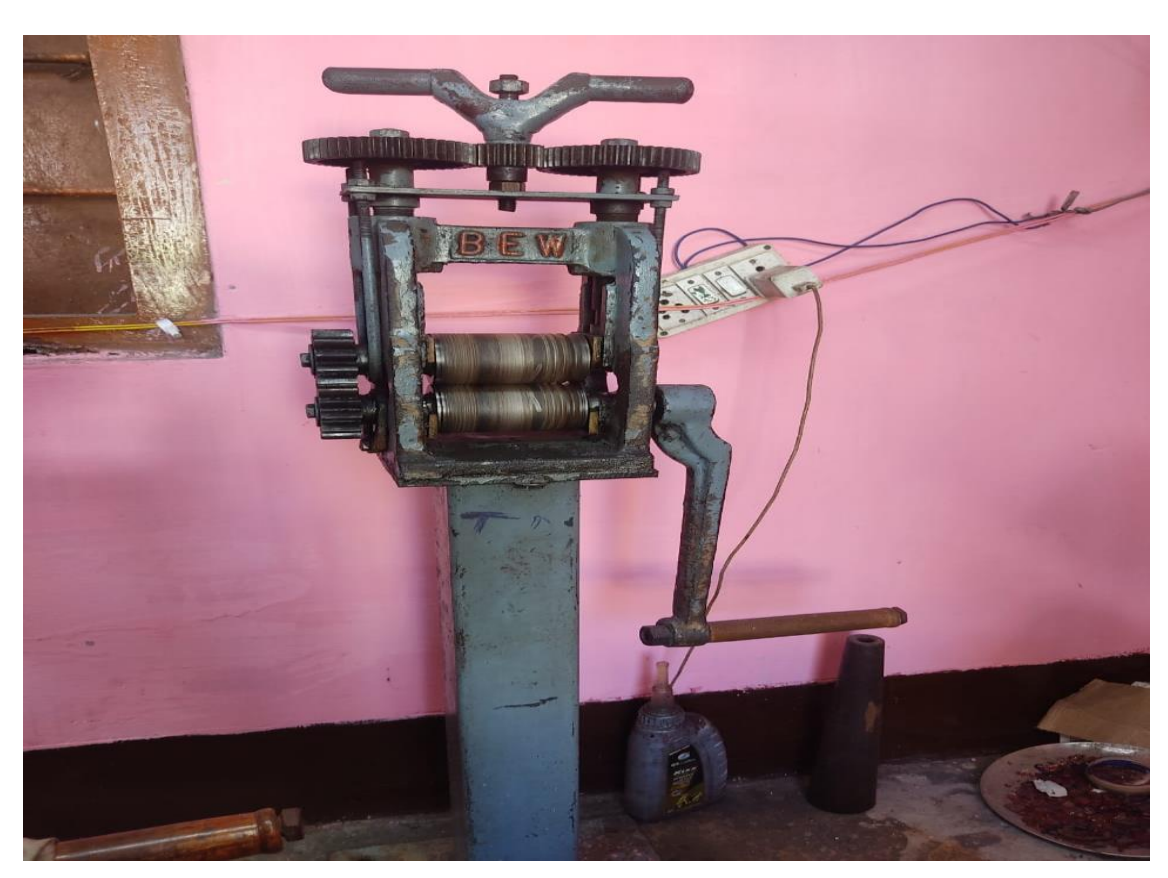
Field Study to Ranthali