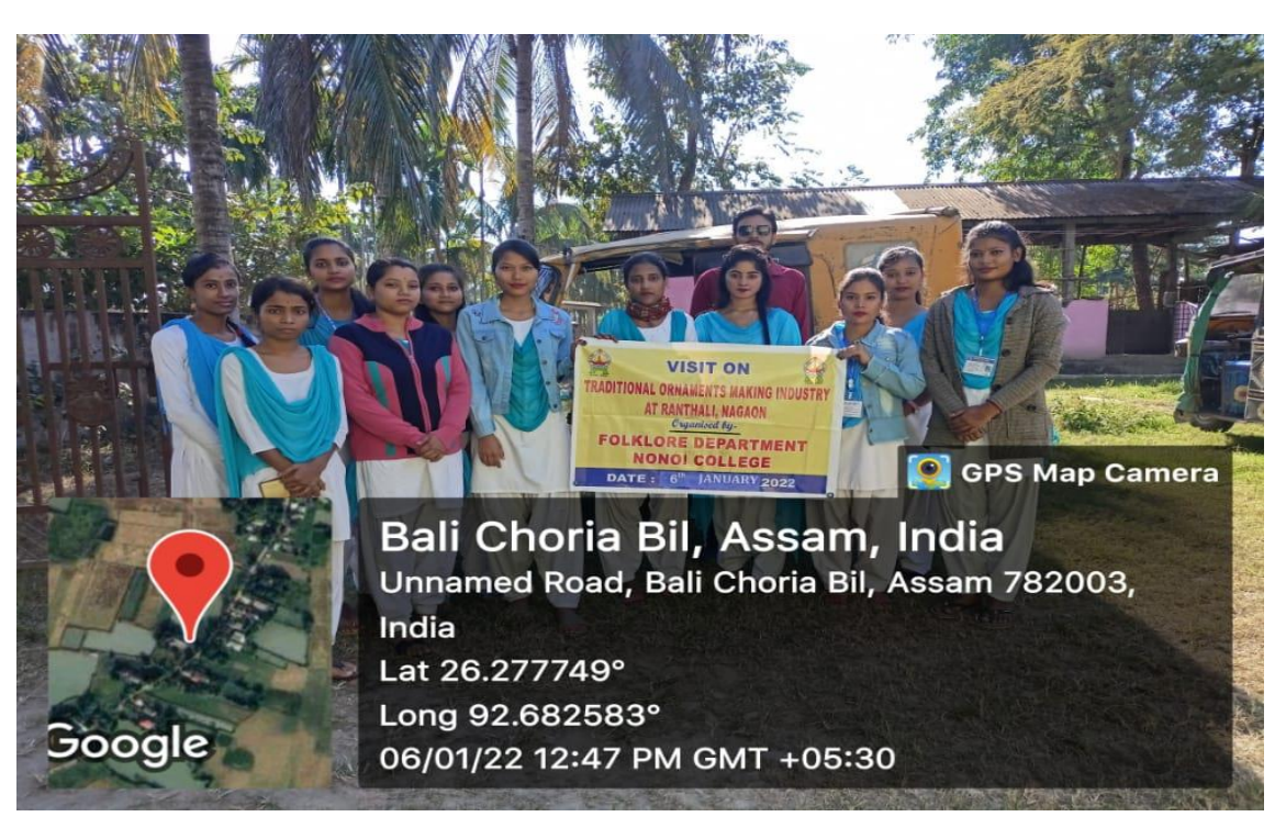
Field Study to Ranthali

The Department of Folklore organised a field visit to Ranthali on 6<sup>th</sup> January, 2022. Assam is known for its plains with greenery, varied wildlife, exquisite jewellery styles, bountiful nature resources and diverse culture. The traditions and attire of Assam along with its enchanting jewellery styles reflect the rich cultural legacy of many tribes and kingdoms that have shaped the state's culture. Traditional Assamese jewellery is crafted by a group of Artisans known as "Sonari". Most of the jewellery styles contain silver or lac as their base metal and gold foil as their coating. Ranthali Village is famous for "Assamese jewellery" not only in the state but also throughout India. Located approximately 8 k.m. away from Nagaon town, Ranthali village is the home to the majority of the skilled jewellery artisans of Assam.